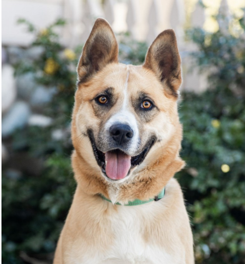
Photo of adoptable dog, Jasper

103 Meadowridge Lane · P.O. Box 548 · Portola, CA 96122 · (530) 832-4727 · HighSierraAnimalRescue.org